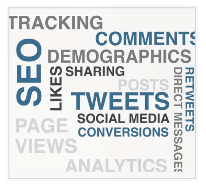
Figure 1. Each brand must develop its own social key performance indicators (KPIs).